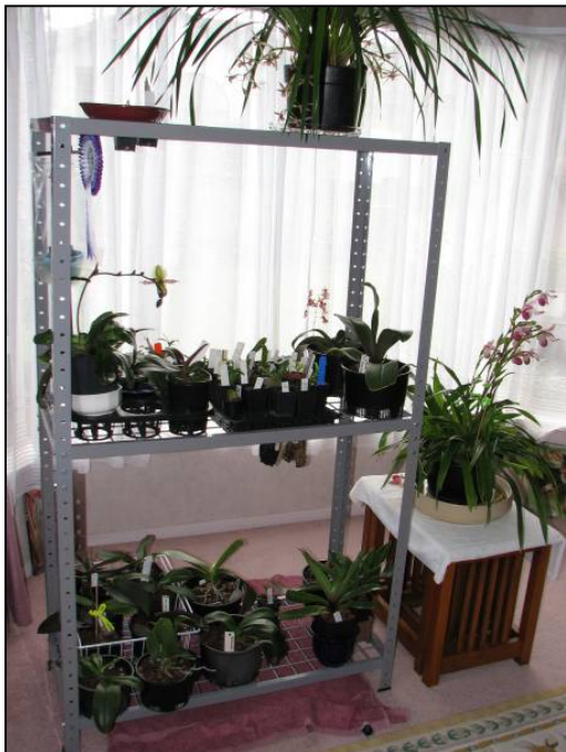
← An indoor plant stand. A cold frame made from a recovered window frame. ↓