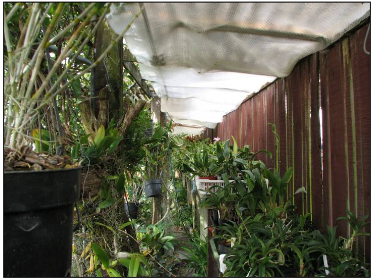
Lean-to supported by fence → and recovered timber posts. Roof insulated with bubble wrap, supported by recovered pipe from clotheslines.