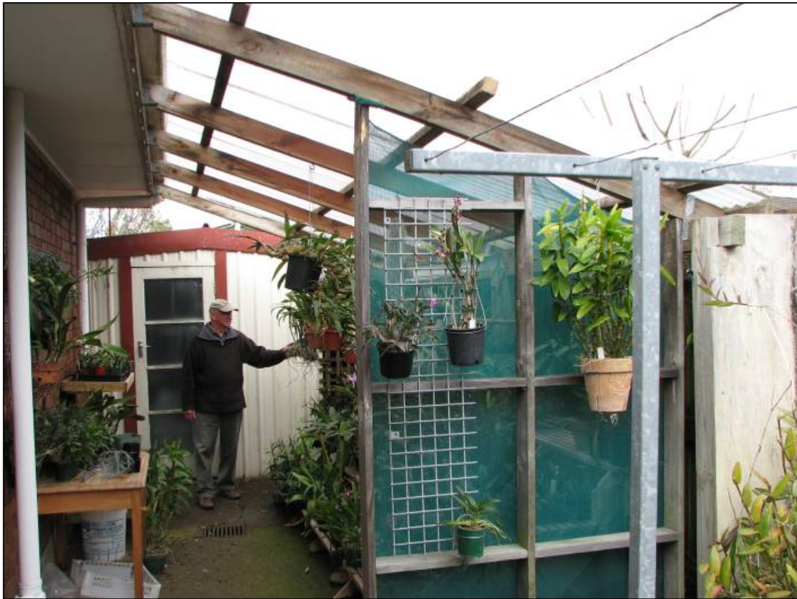
Simple lean-to structure with polycarbonate roof ↑