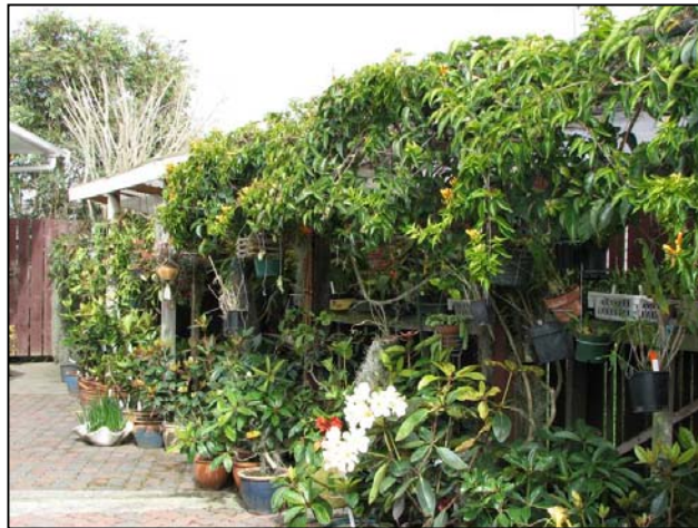
Orchids in the garden ↓