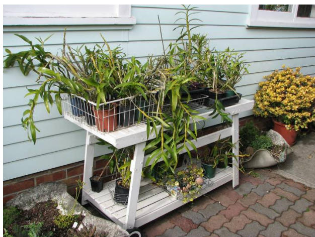
←An old BBQ table makes an ideal orchid stand!