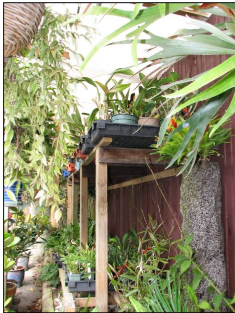
←Stands under the canopy