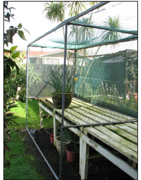
A shade house made from light grade fence railings.→