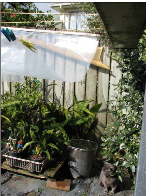
← Rainwater does not go to waste in this garden...