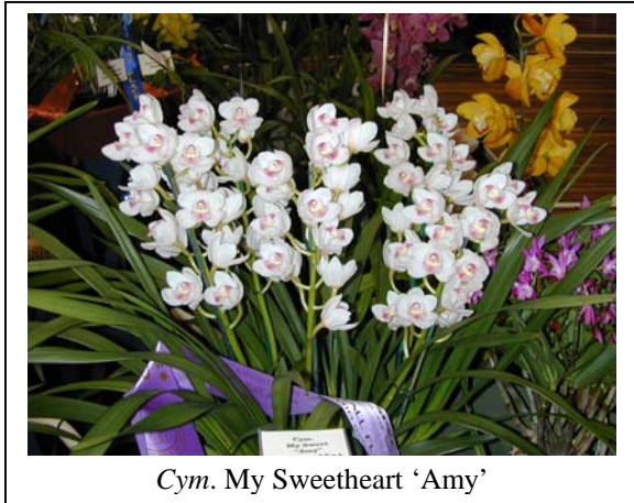
Cym. My Sweetheart 'Amy'

The cymbidiums were there in full cry for the show and the quality and growing of them had to be seen to be believed. Huge flowers and often plants with up to 6 spikes. Most varieties were ones I had never heard of or seen before. Several I looked up on the RHS Orchid Registration pages on my return to find the breeder and parents but they weren't recorded yet. Wonderful large, round, filled-in reds with bold lips. Hopefully some of my shots are good enough for the editors to show them off here.