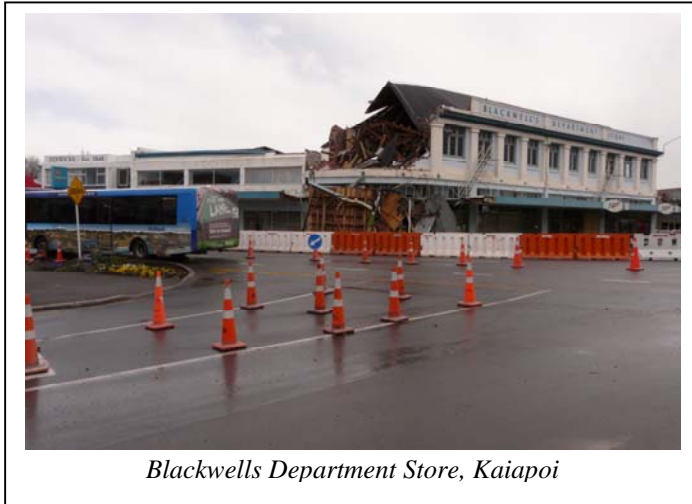
Blackwells Department Store, Kaiapoi

On 4 th September 2010 at 0435hrs the world changed for the people of Christchurch, her surrounding suburbs and local towns.