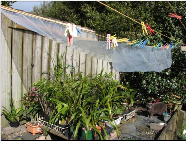
← A nearby fence and a wash line make a brilliant support for a simple rain shelter. Note the option of having shade cloth under the rain shelter during summer time. ↓