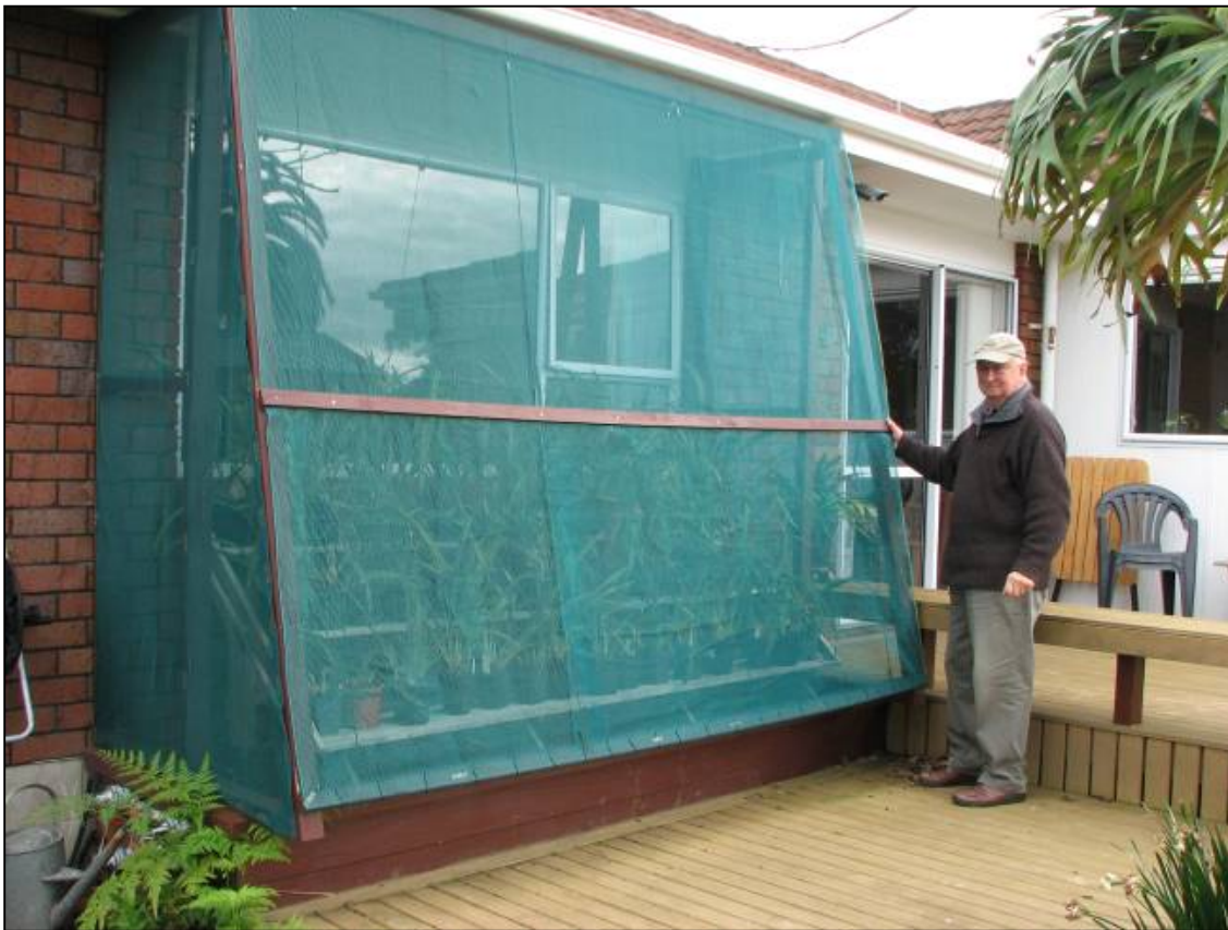
Shade house, utilising the eaves of the house. ↑