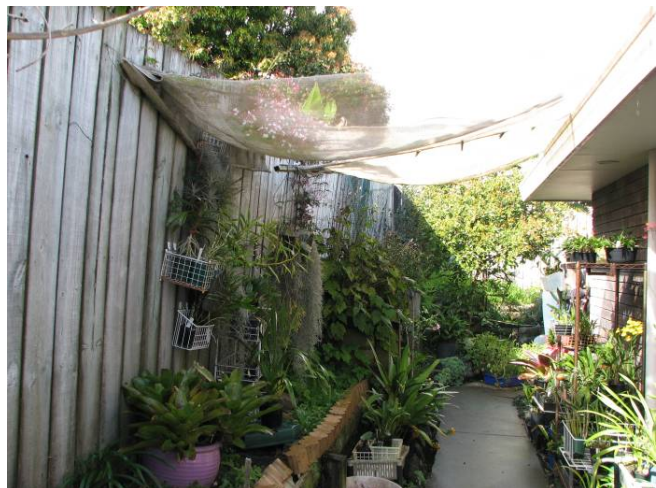
Shade cloth between the eaves of the house and a nearby fence ↓