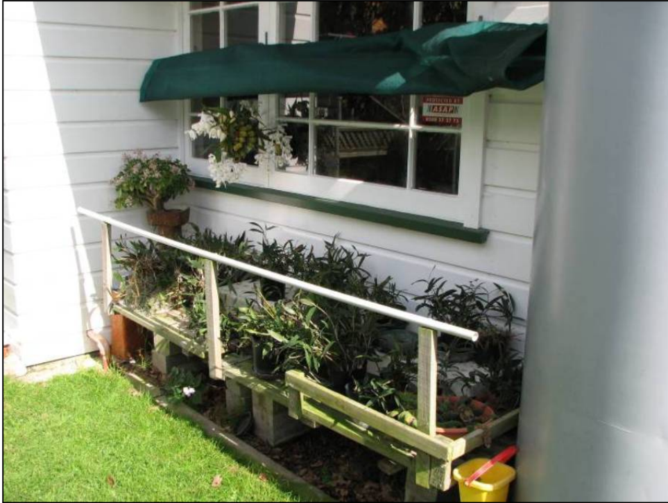
A shade house under the eaves of the house. ↑ Note the plastic pipe to keep the shade cloth away from the plants.