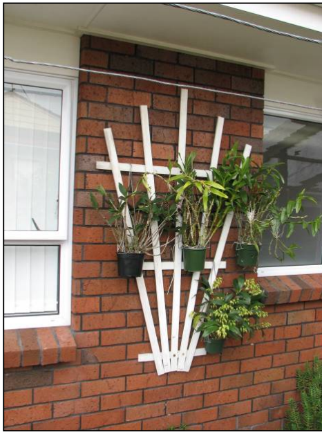
←Simple trellis frame is ideal to hang some orchids