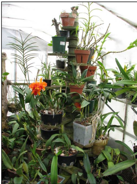
← Innovative plant stand.