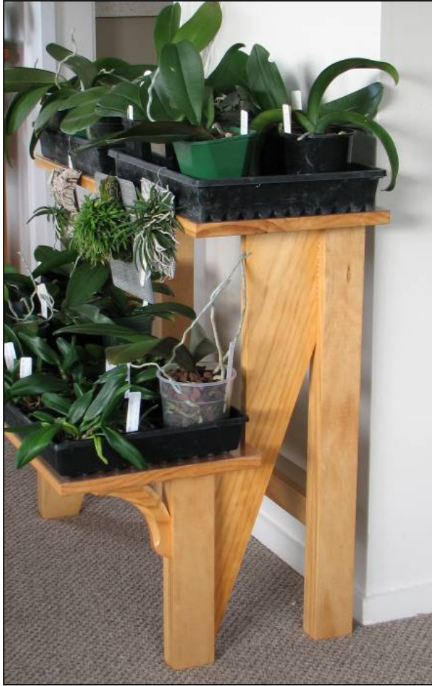
← Indoor stand for seed trays. Indoor Phalaenopsis stand ↓