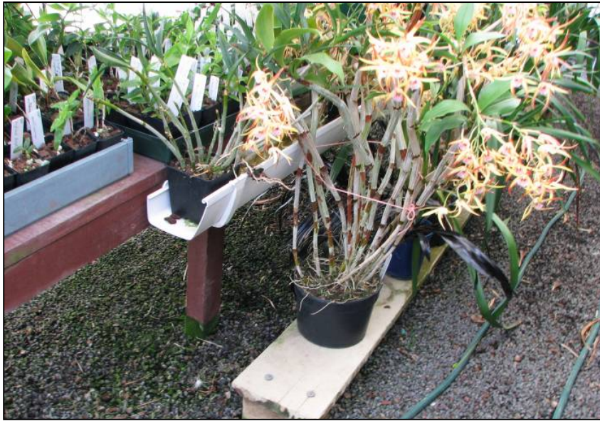
← Note the use of plastic gutters to stand the plants in.