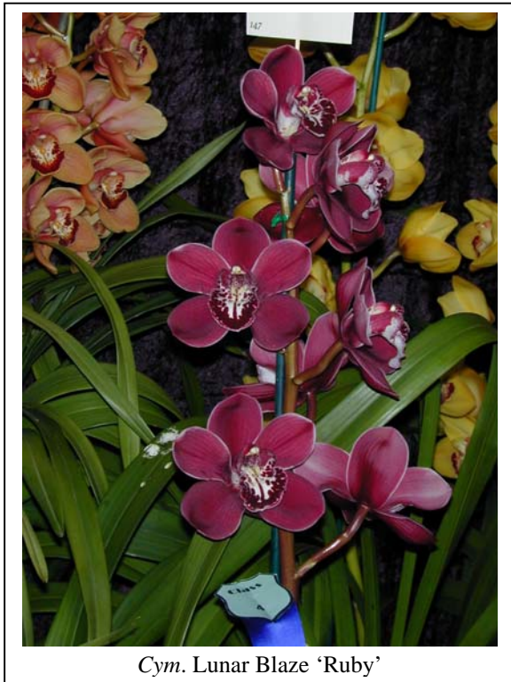
Cym. Lunar Blaze 'Ruby'

'#2' and it was bedecked with a number of OSCOV ribbons. I didn't record all the prizes and owners but tried to get the names down correctly. On the whole the plants were well labelled but there were a few labels that were too far back in the display to decipher.