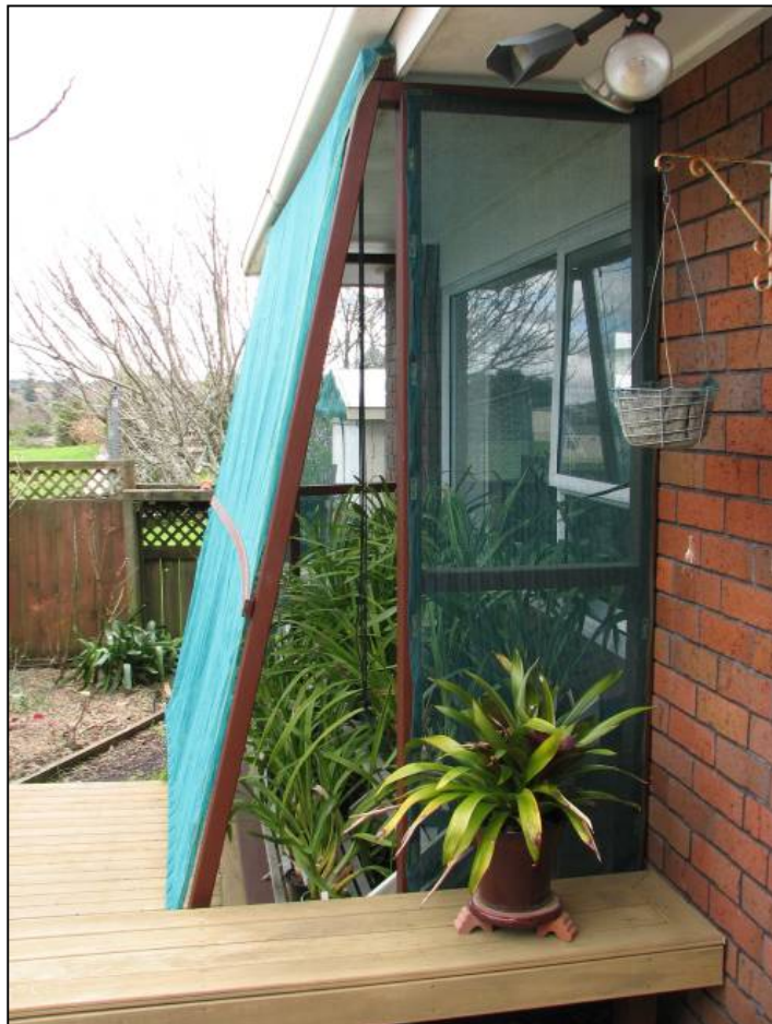
← Another view: Note the angle of the frame to give enough clearance for the plant leaves.