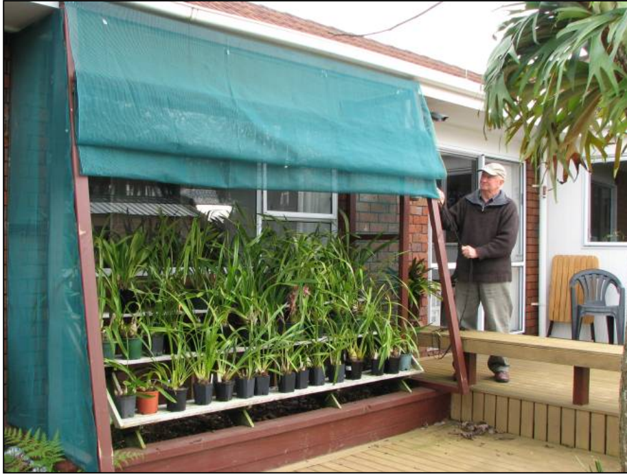
↑ The same structure, showing framing made from standard 75 x 50 framing timber. The front rolls up like a Roman blind, pulled up by 4 ropes over pulleys.