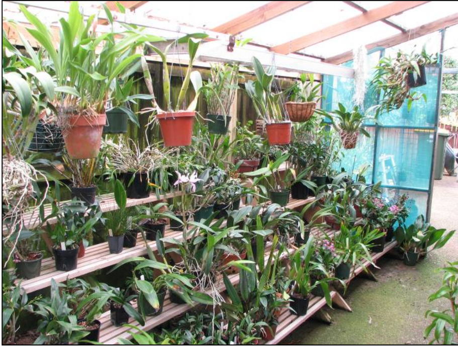
Tiered stands for extra space. Note the old ladder to hang plants from (top left, near roof)