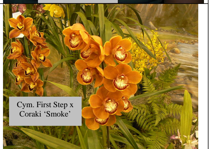
Cym. First Step x Coraki 'Smoke'