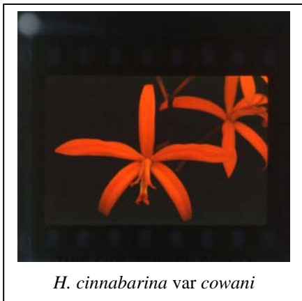
H. cinnabarina var cowani

flower, makes this genus very desirable for the inner city grower with limited bench space.