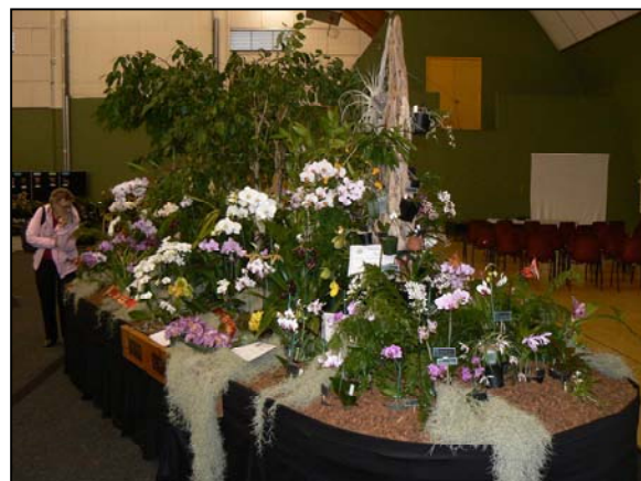
Otago Orchid Club display – lots of Phals!

The wide variety of Australian dendrobiums at the Show ranged from the highly scented Dendrobium speciosum and similar hybrids and cultivars, with large pseudobulbs, leaves and flower spikes, through lots of D. kingianum , D. falcorostrum and D. bigibbum hybrids, to species such as D. teretifolium with long, slender, round, hanging leaves and cascades of