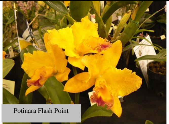
Potinara Flash Point