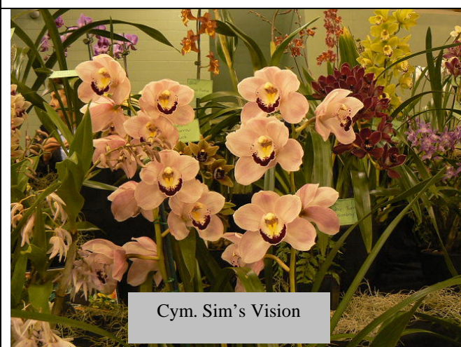
Cym. Sim's Vision