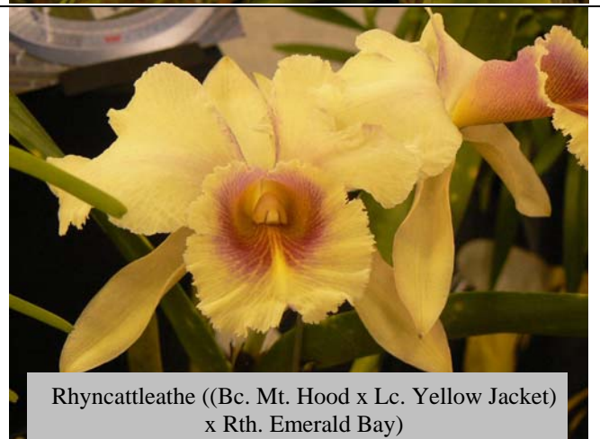
Rhyncattleathe ((Bc. Mt. Hood x Lc. Yellow Jacket) x Rth. Emerald Bay)