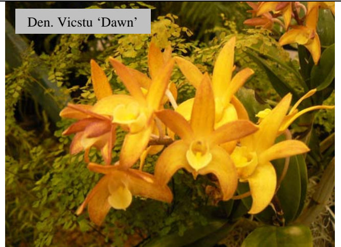
Den. Vicstu 'Dawn'