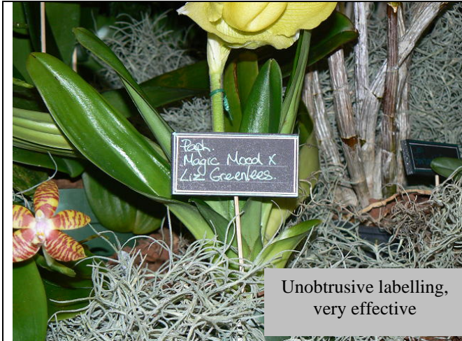
Unobtrusive labelling, very effective

Note, photographic conditions at shows may be difficult, and it was not possible to ascertain the names of some growers so, in general, growers names have not been shown.