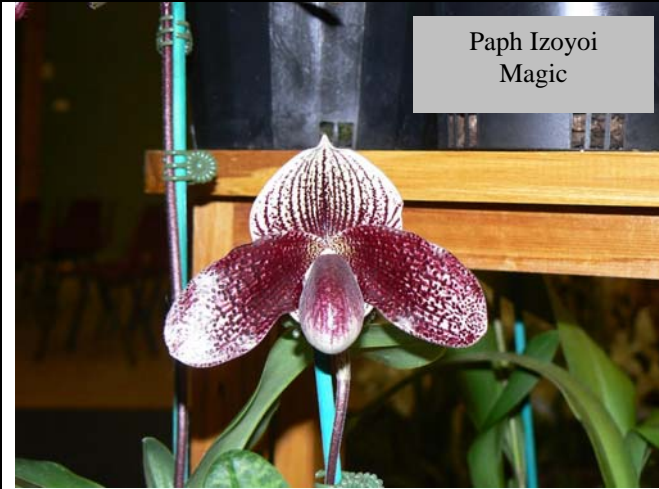
Paph Izoyoi Magic