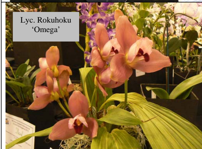
Lyc. Rokuhoku 'Omega'