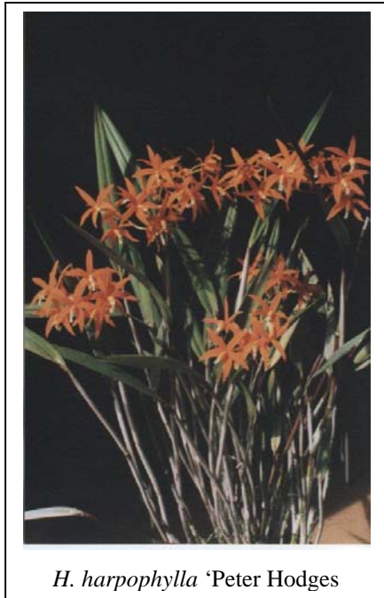
H. harpophylla 'Peter Hodges'

There are about 42 species included in this group. These have the characteristics of genuine rock-dwellers. Some species grow tall; i.e. H. harpophylla with hard, pencil-like pseudobulbs 40x1cm and a single, tough, leathery leaf 27x4cm with a bunch of bright orange, starry flowers, to 8cm across, on a 15cm stem.