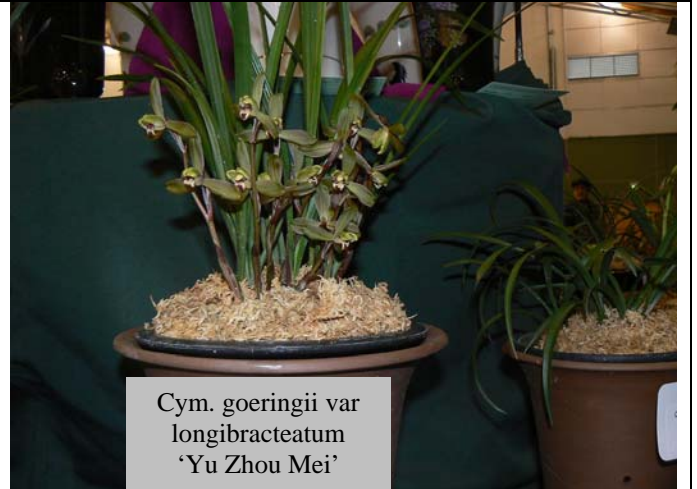
Cym. goeringii var longibracteatum 'Yu Zhou Mei'