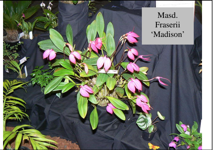
Masd. Fraserii 'Madison'