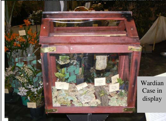
Wardian Case in display