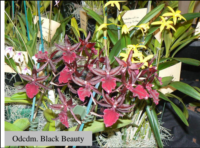
Odcdm. Black Beauty